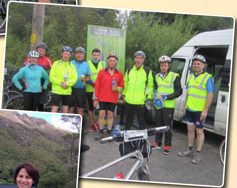
A break in Tourmakeady