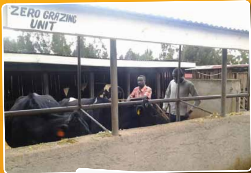
Julius and Solomon at the zero-grazing unit